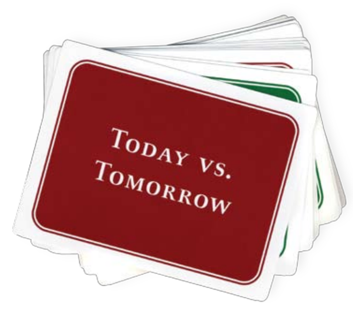
Wells Fargo Advisors' unique Envision Priority Cards help you clarify your financial goals and prioritize your objectives.

Envision also offers you the flexibility to adjust your priorities, when necessary, based on fluctuating market conditions or life-changing events.